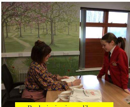
Book signing in our library