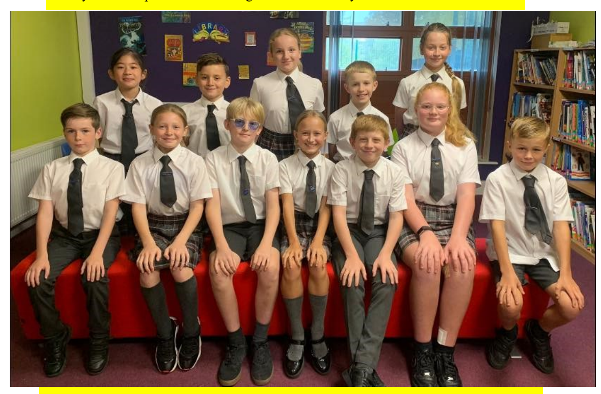
Here are our fantastic Sports Council 2023/24. They will be a great asset to SJtL and we know they'll do a super job.