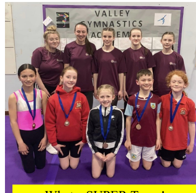
What a SUPER Team!

We recently competed in our very first ever Gymnastics event .....we came FIRST! Well done to this team!