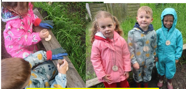
Making and wearing our medals!