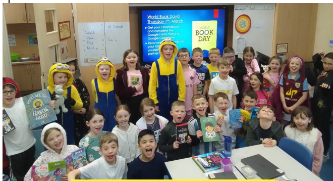
We loved World Book Day!

"In science we have started to learn about living things. We learnt that animals can be split up into 2 groups - vertebrates and invertebrates. Vertebrates are animals that have a back bone like humans, and invertebrates are animals that don't have a backbone like slugs."